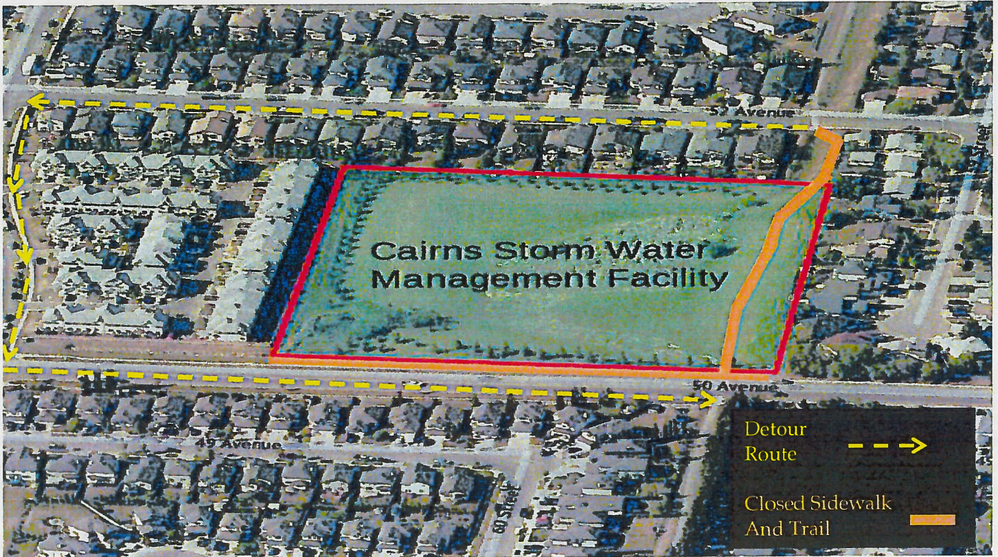
Image 1 - Existing Cairns Storm Water Management Facility